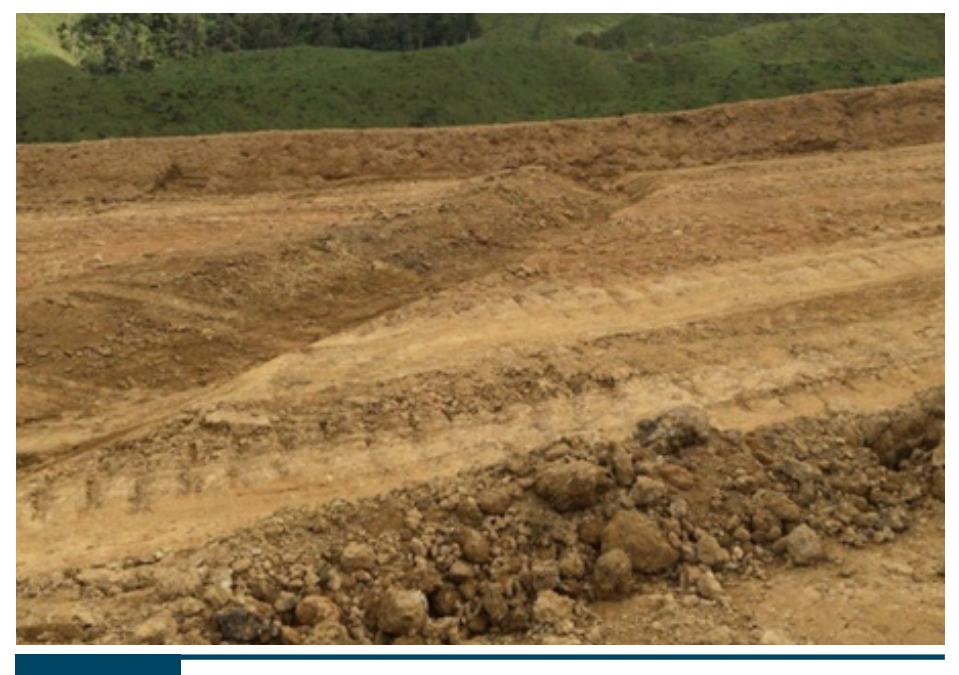
Contour drain